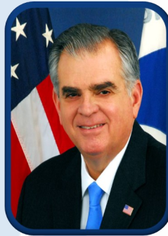
The Honorable Ray LaHood U.S. Secretary of Transportation (2009-2013) Member of U.S. Congress (1995-2009)